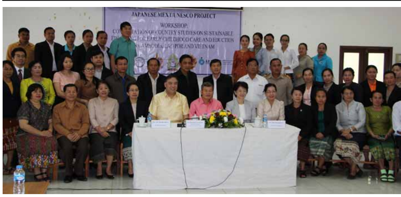
Representatives from UNESCO Bangkok, Kobe University, international organisations and development partners gather at